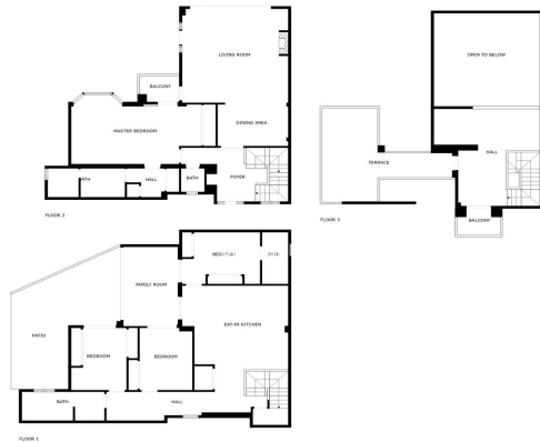
SIZES ARE APPROXIMATE, ACTUAL MAY VARY.