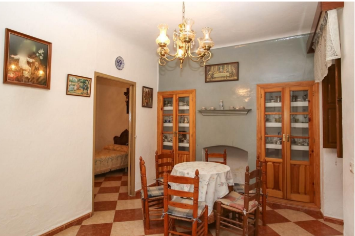
130 000 €