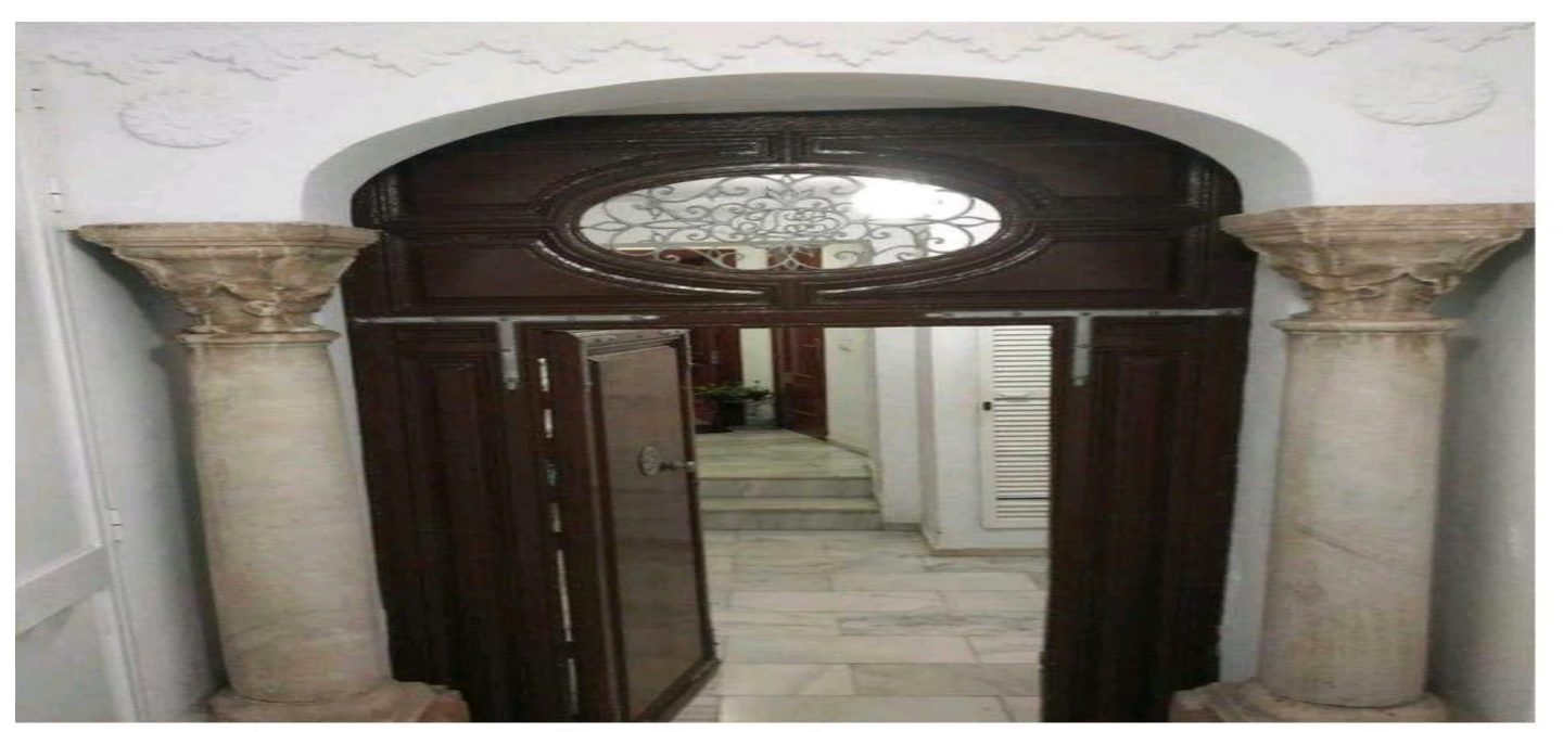
Portal - escaleras

Reference : R5022037 Bedrooms : 2 Bathrooms : 1 Build Size : 85m<sup>2</sup>