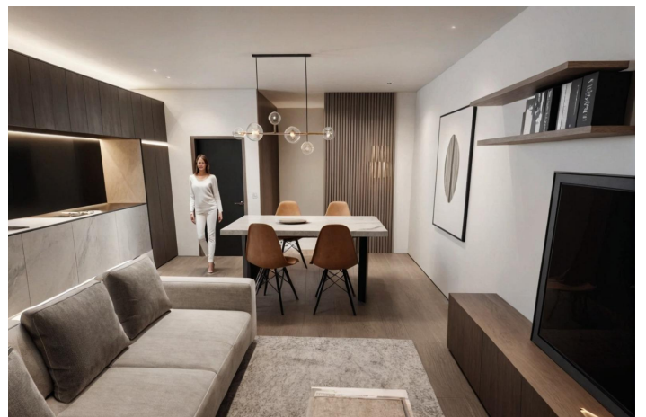
Aticos Estudio B y Vivienda A