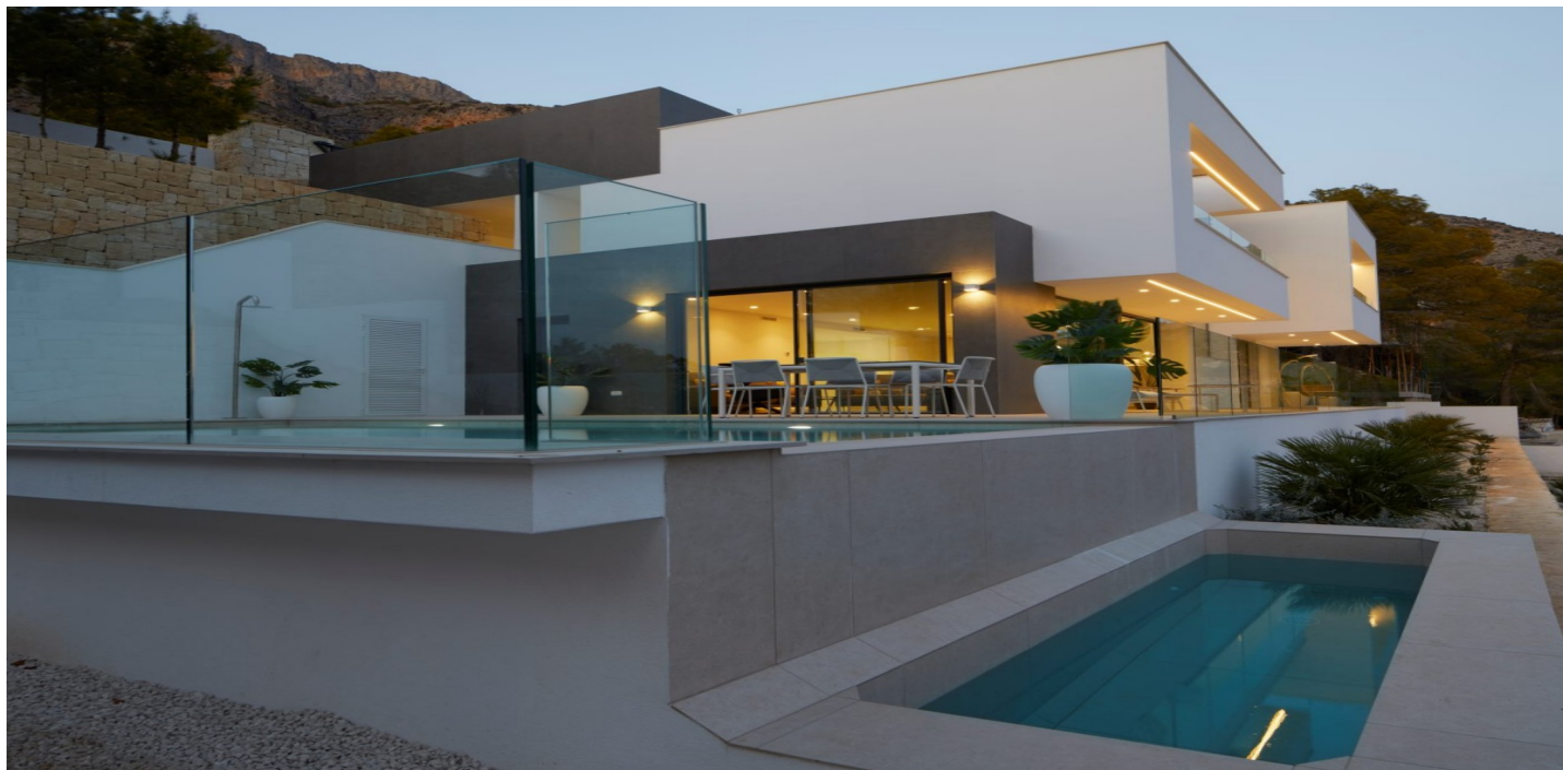
FINISHED AND FURNISHED PROPERTY. KEY READY

Reference: 4380ALT Bedrooms: 4 Bathrooms: 6 Plot Size: 1,252m 2 Build Size: 535m 2