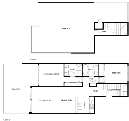
SIZES ARE APPROXIMATE, ACTUAL MAY VARY.