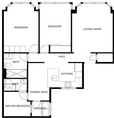
SIZES ARE APPROXIMATE, ACTUAL MAY VARY.