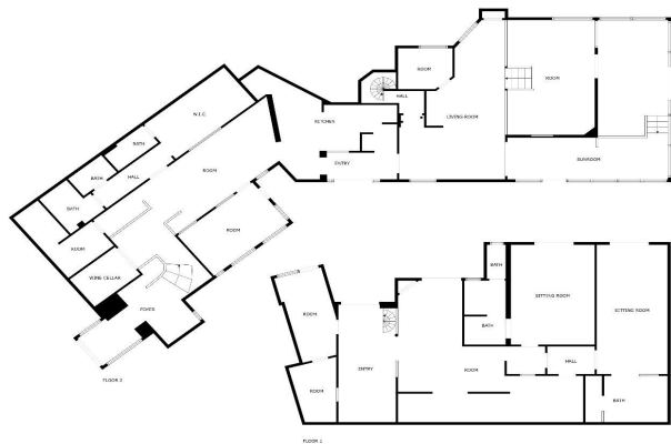
SIZES ARE APPROXIMATE, ACTUAL MAY VARY.