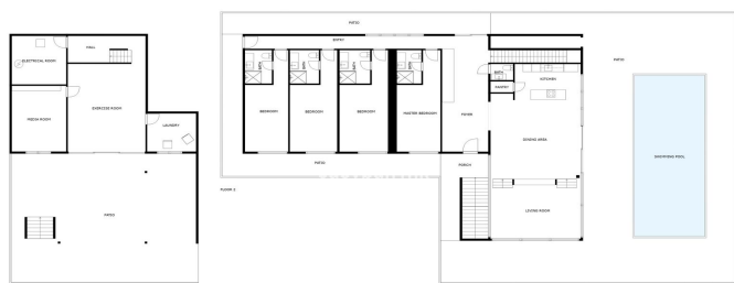
SIZES ARE APPROXIMATE, ACTUAL MAY VARY.