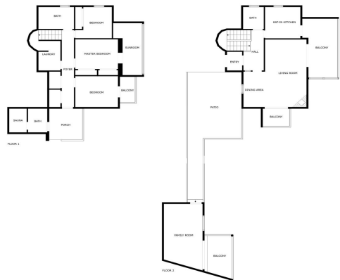
SIZES ARE APPROXIMATE, ACTUAL MAY VARY.